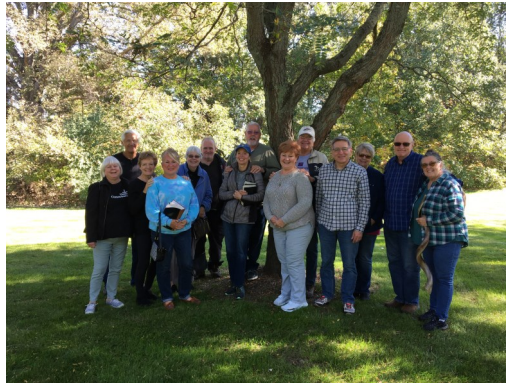
Lapeer County Ministerial Prayer Group